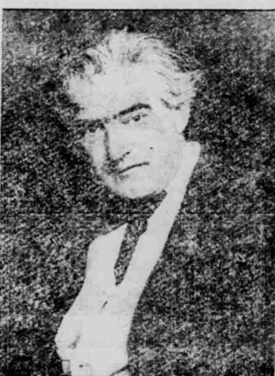
Mr. Tyrone Power

as Maverick Brander in "The Texas Steer" at the Gem Tuesday, Feb. 22.