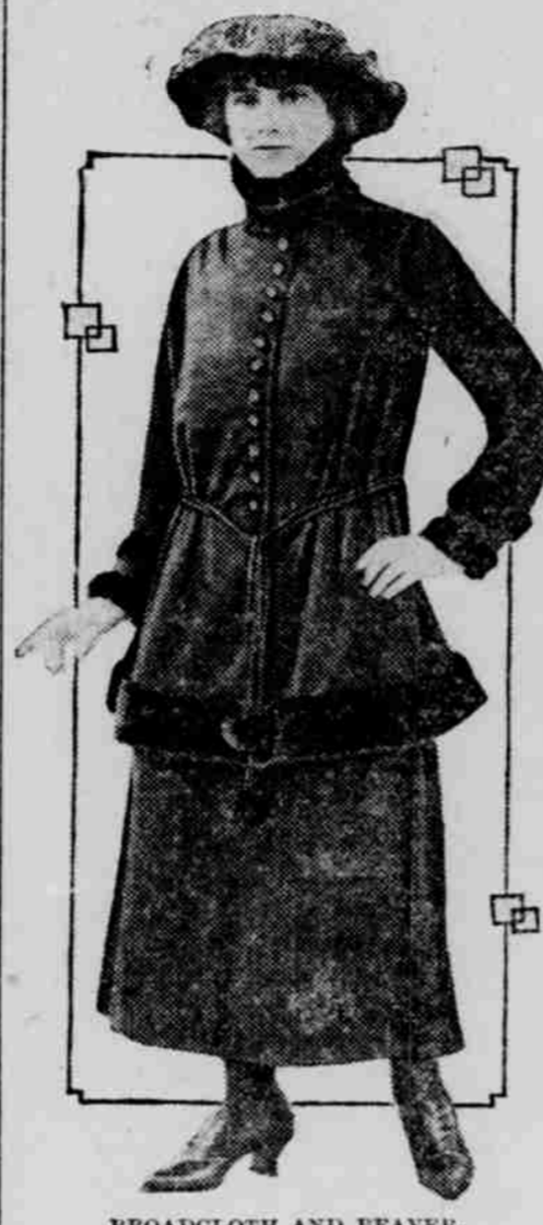
BROADCLOTH AND BEAVER.

Extremely Good Lines For Fifteen-year-old Girl.