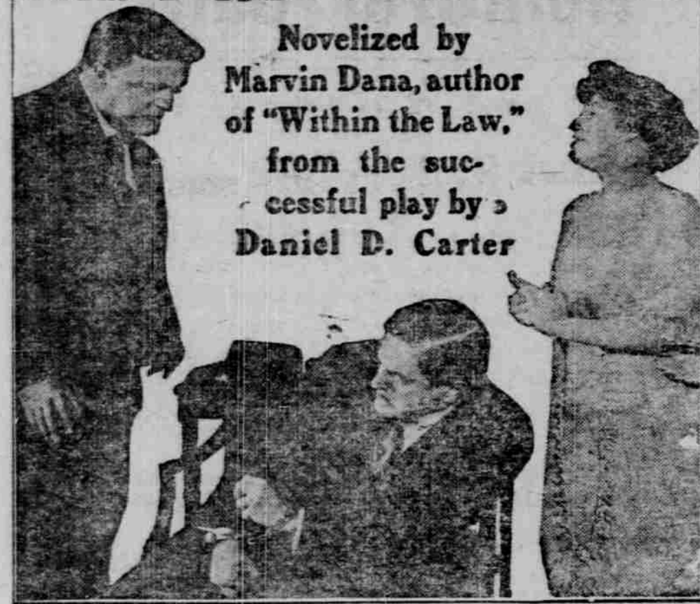
Copyright, 1913, by the N. K. Fly company.