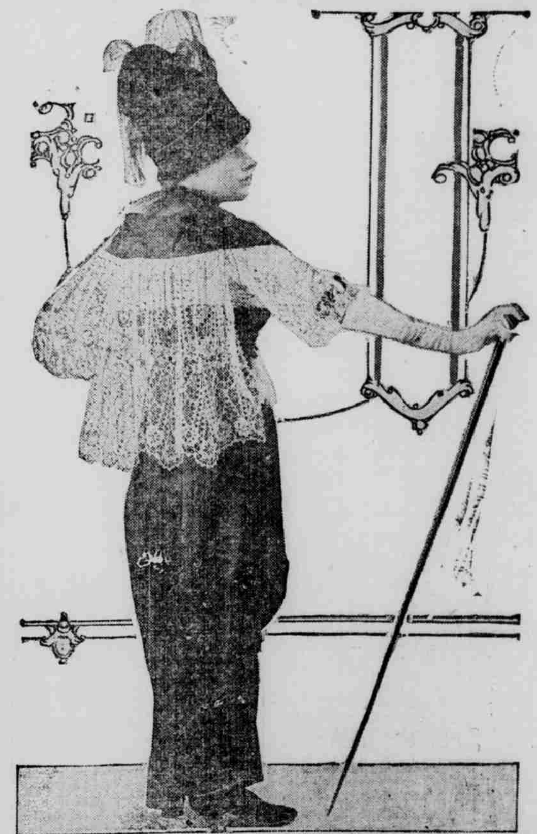
SATIN GOWN WITH LACE CAPE.

Picturesque Medieval Style Revived In the Page's Cape