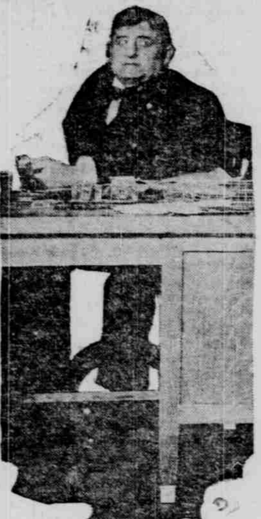
"On the level, when did you see Mary Turner last?"

plied. "I never laid eyes on it till now." "English Eddie was killed with this gun last night. Now, who did it?"