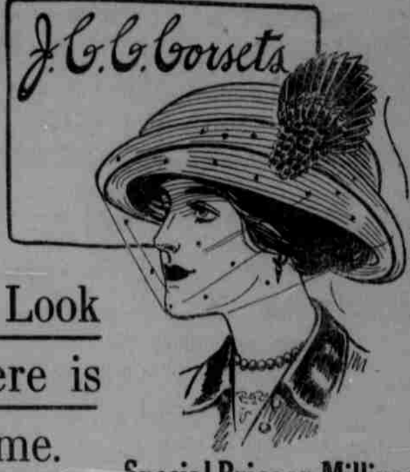
Special Price on Millinery

We are going to exert every effort to make this one the greatest success of them all, and if low prices on high quality goods will bring the business. We are confident that your money will go farther in buying at this Spring Sale than ever before. Look these prices over and come in and be convinced there is no need to go out of town when such a sale is at home.