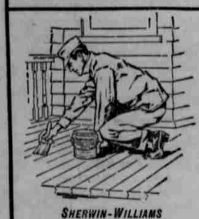
PORCH AND DECK PAINT