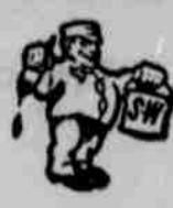
Says the Little Paint Man.

We don't always realize what harm the wear and tear of the weather does to our houses and barns and buggies and wagons that are not protected by good paint. Buildings that have not been painted or on which the paint has worn off, are exposed one day to the wet and the rain, the next day to the hot sun and so on, until the unprotected wood twists and warps and cracks and the rot starts. So a building that should be in good repair at the end of 50 years, if it had been kept properly painted, goes to rack and ruin in 15 or 20. And think how it looks.