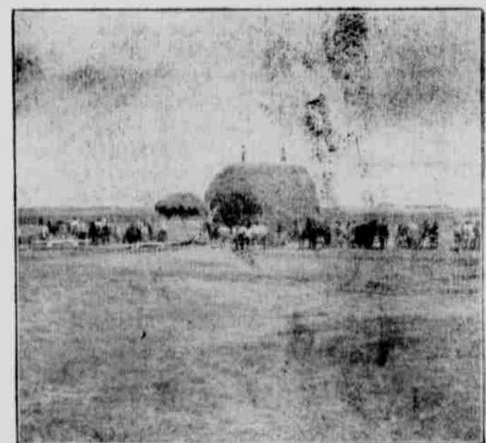
Haying Scene Near Merino

Let us show you this property, and if you don't say it's the best property for the money you ever saw, we won't expect you to buy.