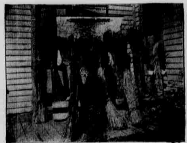
Exhibit of Grain and Grass Crown in this Valley

The prices of this land range from $50 to $80 per acre on easy terms at six per cent interest and