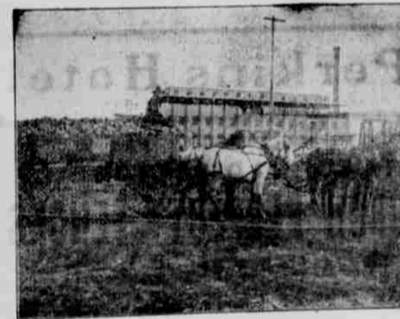
Hauling Beets to Factory at Sterling