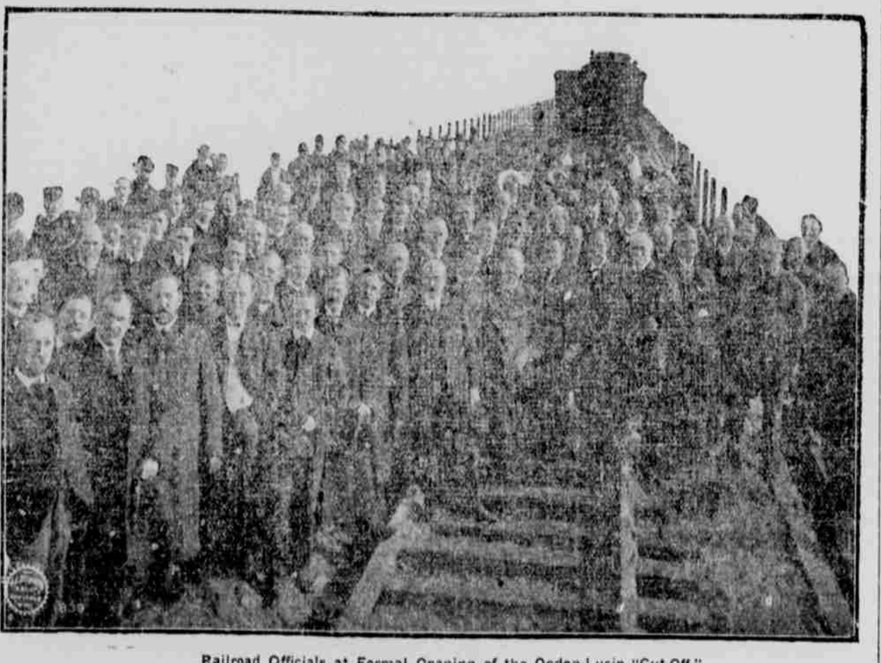
Railroad Officials at Formal Opening of the Ogdan-Lucin "Cut-Off."