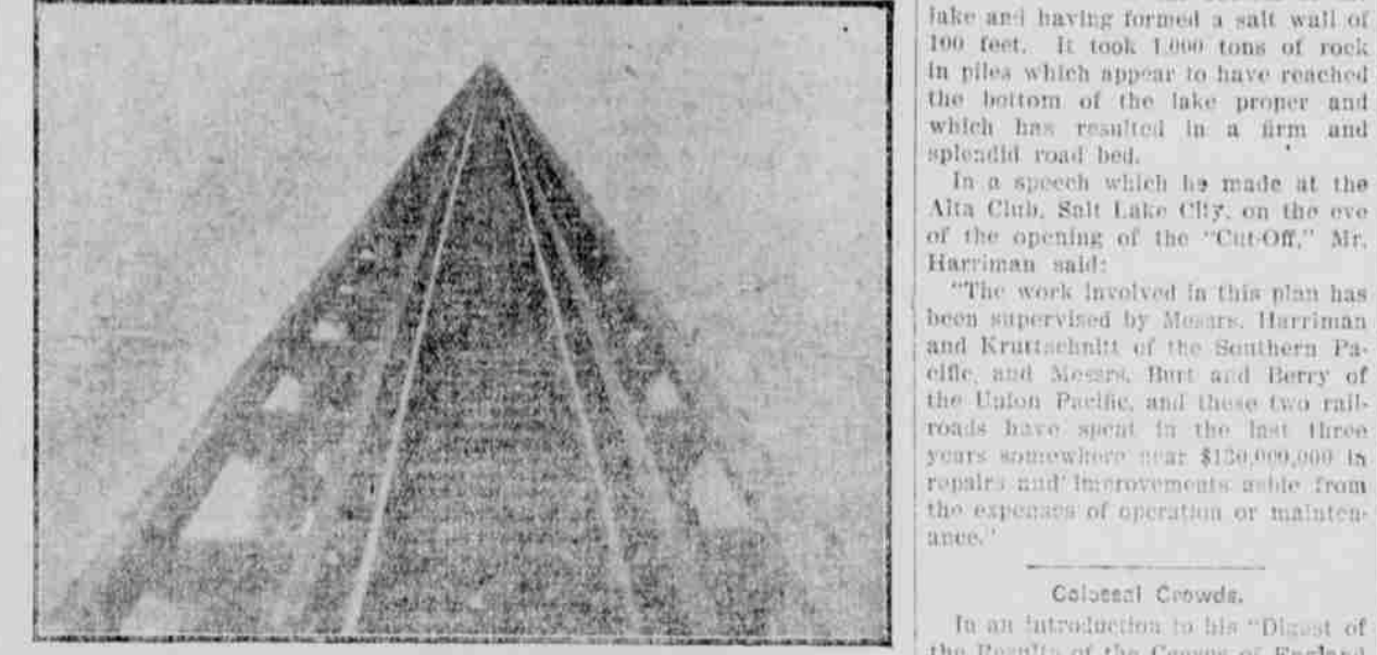
View of the Track Across the Great Salt Lake.

of track is one of the most expensive of the Harriman system, the maximum grade over the long Promontory hill is 144 feet to the mile and helper engines are always necessary. The elimination of the use of these engines will mean the saving of at least $1,500 a day in operating expenses and also a saving of several hours in running time.