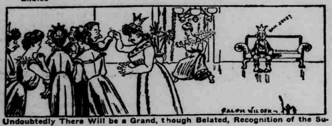
perior Charms of the Domestic Article.