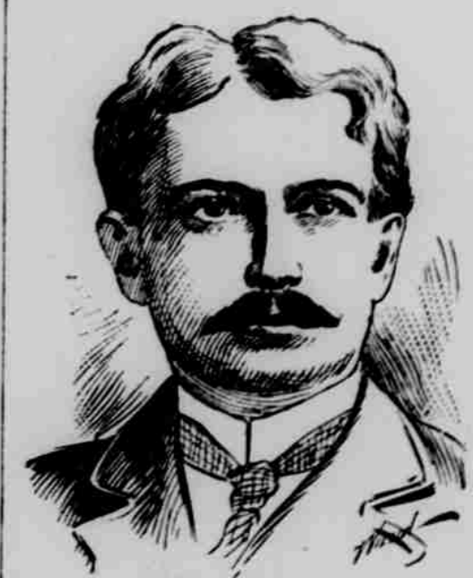
Myron T. Herrick.

High-Priced Stamps. Some of the postage stamps shown at an international stamp exhibition at Muehhausen, Alsace, are priced at $25,000 each.