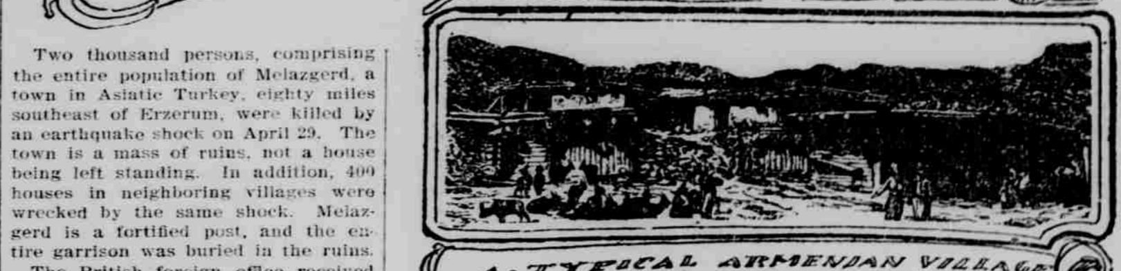
A TYPICAL ARMENIAN VILLAGE

Two thousand persons, comprising the entire population of Melazger, a town in Asiatic Turkey, eighty miles southeast of Erzeroum, were killed by an earthquake shock on April 29.