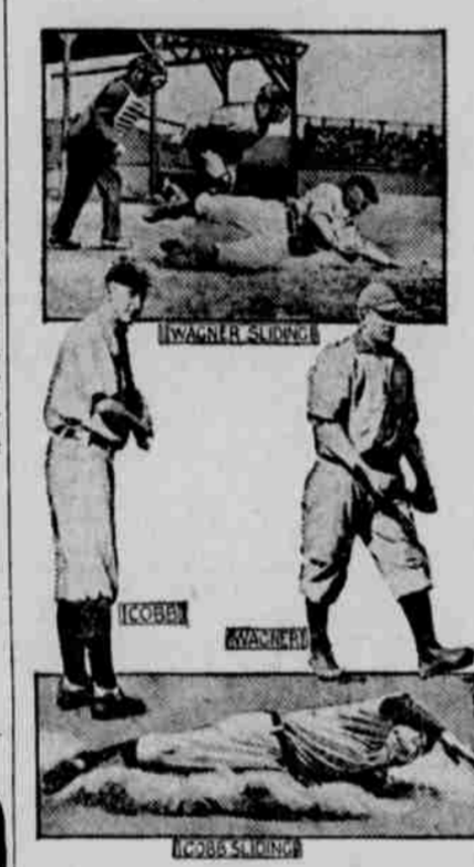
HOW THE TWO GREAT PLAYERS PERFORM ON THE DIAMOND

The comparison between Cobb and Wagner is an interesting one. Both achieve great results, but not in the same manner. Wagner is a ponderously perfect athlete, while Cobb, a slender, delicate appearing chap, possesses ability which is constantly brought to the surface by his brilliant plays and the wonderful spirit that has made him envied and hated by others. Both men are wonderful hitters, wonderful base runners and wonderful fielders. For more than twelve years