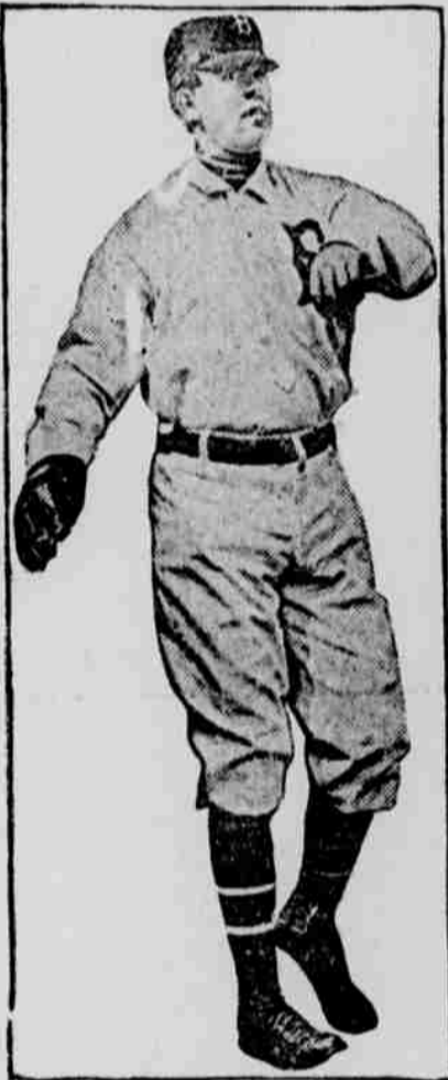
NAP RUCKER, BROOKLYN NATIONALS' STAR PITCHER.

Another important point for a young twirler to master is in covering first