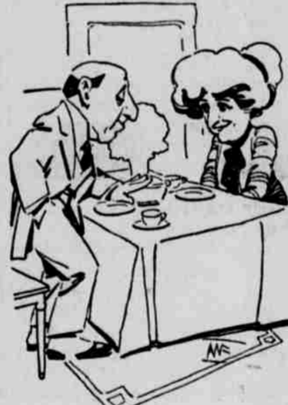
"I GUESS NOT!" HE EXCLAIMED.

"James, I have decided to do without a new dress, and with the money