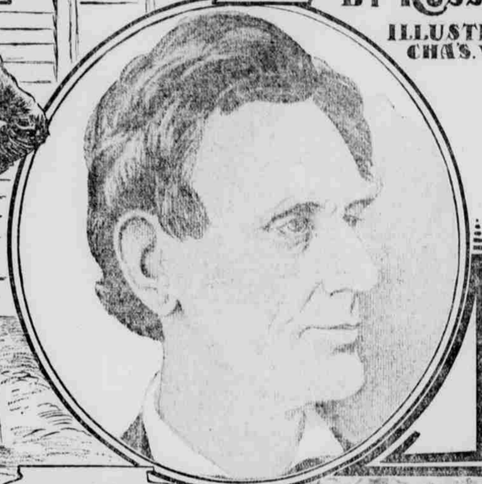
ABRAHAM LINCOLN BORN 1809 DIED 1865