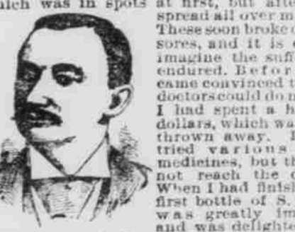
Portrait of a man, likely related to the S.S.S. advertisement.