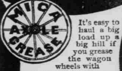
MICA Axle Grease