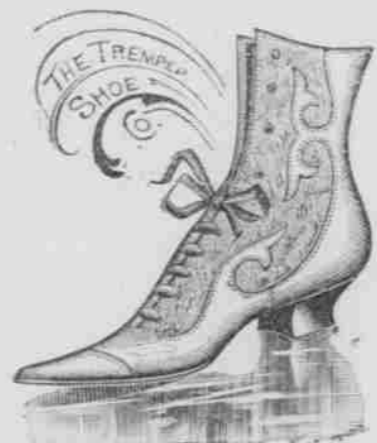
THE BEST WE GARRY $3.50.

This Shoe, in many places, will cost you $4 and $5.