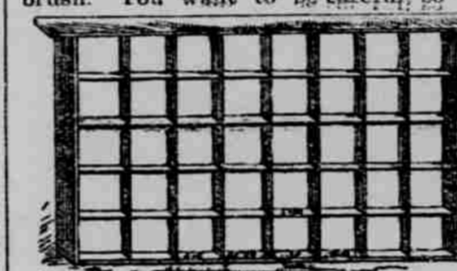
PLAN FOR MAKING SMALL SECTIONS.

These little blocks are made by gluing a three-eighths board on top of a seven-eighths board, as you see. Now, with a circular saw, cut grooves clear through the thin board until the saw strikes the thick one.