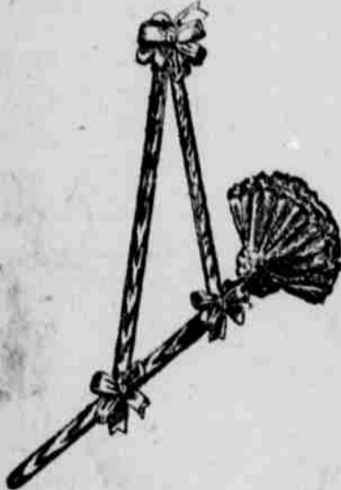
HOLDER FOR FEATHER DUSTER.