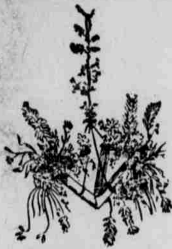
THE FLOWER CHANDELIER.