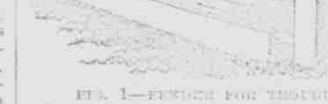
FIG. 1.—FEEDER FOR TROUGH.

The following descriptions, with illustrations of feeders for hen trunks.