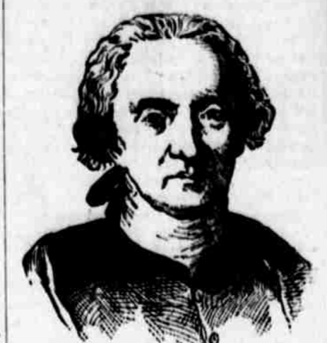
CHARLES CARROLL OF CARROLLTON.

July is a wonderful month in the history of all nations, and in many of them the leading anniversary falls in that month. Of course this is not the result of mere accident. It has often been remarked that more startling and important events have occurred in one month of midsummer and one of midwinter than in all the rest of the year, and truly man is so far subject to nature that stirring events seem to crowd, as it were, toward that period when vegetation for the most part completes its growth.