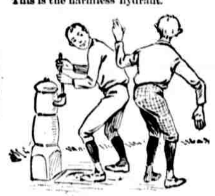
And this is the naughty small boy who, with the help of a stick, turned the spout thereof upside down.