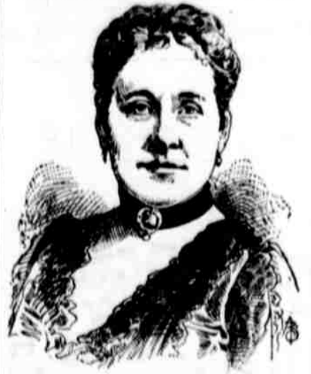
LADY STANLEY OF PRESTON. The wife of the governor general of Canada by right of position is the "first lady in the Dominion."