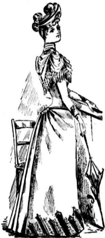
AT THE GRAND PRIX

The second costume, designed by Reifern, is to worn