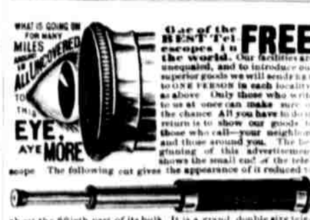
ri of its bulk S2 to S10 a day at h make n auterised. Better write at once We pay all express charges

AND INSTITUTE OF PENNANNUP thand, and Typewriting, is the best and large eavin the West. 60 Students in attendance is College in the West, 600 Students in attendance last year. Students prepared or business in from 1669 months. Experienced faculty Personal instruction Beautiful illustrated catalogue, college pournals, and specimens of penmanship, sent free by addressing LILLIBRIDGE & ROOSE, Lincoln, Neb