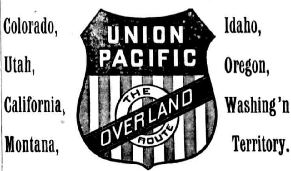
Take the overland flyer and save one day to all Pacific coast points.

Shortest and Quickest Route to all points in