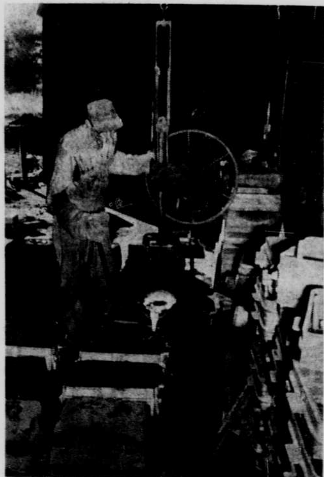
Walt Salmen pours molten cast iron into chain sprockets