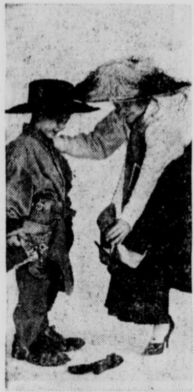
Youngsters make news Those wonderful things your kids do at play are too good to keep to yourself. Share them tonight with a Long Distance call to the folks. A telephone chat is so inexpensive...and so enjoyable. Northwestern Bell.