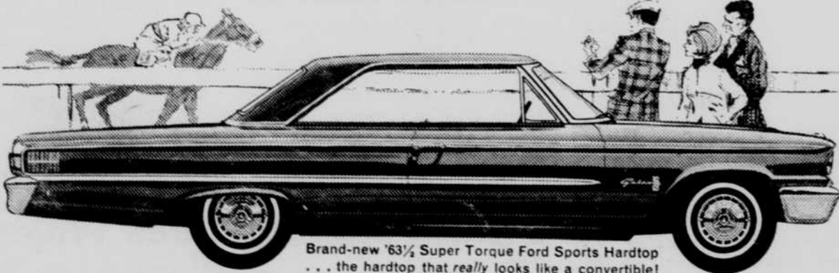
Brand-new '63 1/2 Super Torque Ford Sports Hardtop... the hardtop that really looks like a convertible!