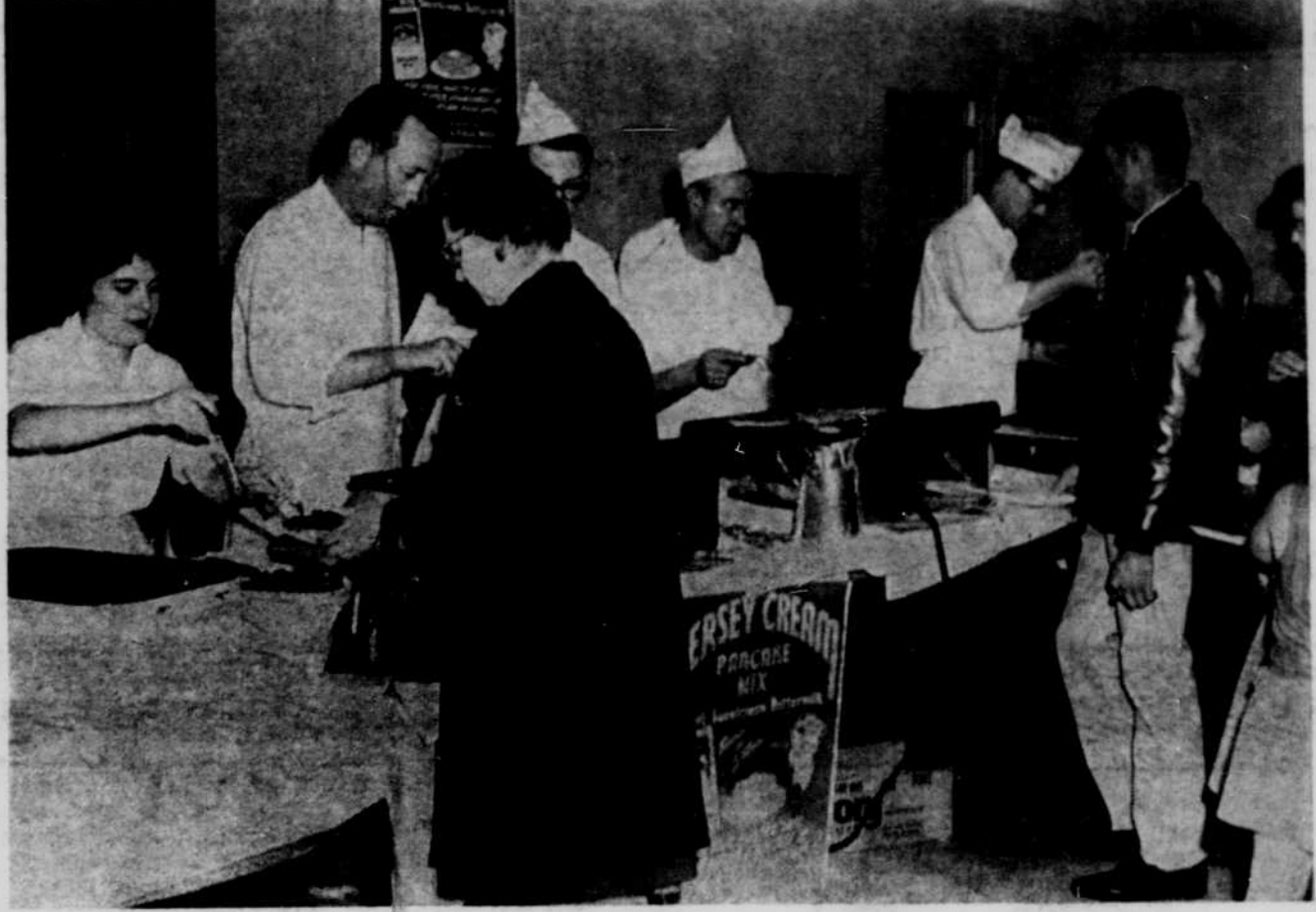
OVER 600 DOLLARS was taken in Saturday at the benefit pancake feed held at the Legion hall in O'Neill. Proceeds will go to the band fund to help send the Indianapolis "500" festival.