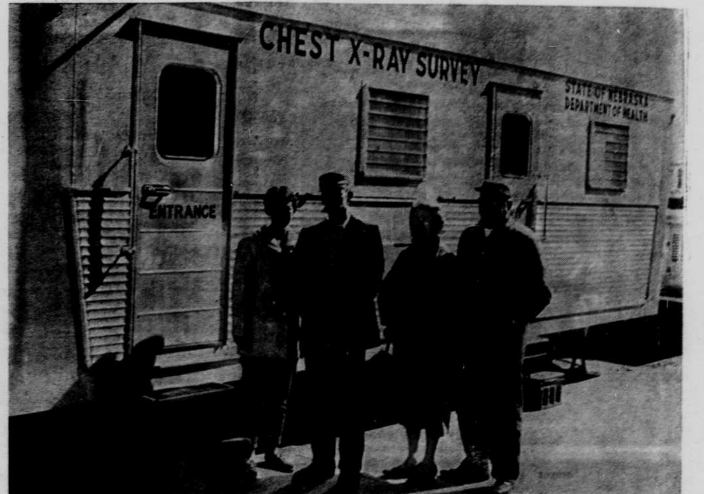
THE CHEST X-RAY UNIT has seen a steady line of persons waiting to get their free chest x-ray. Residents are reminded that the unit will remain in O'Neill until March 22 but will not be open on Saturday or Sunday. Anyone 18 years of age or over is invited to stop in for their free x-ray. The unit will move on to Atkinson March 26.