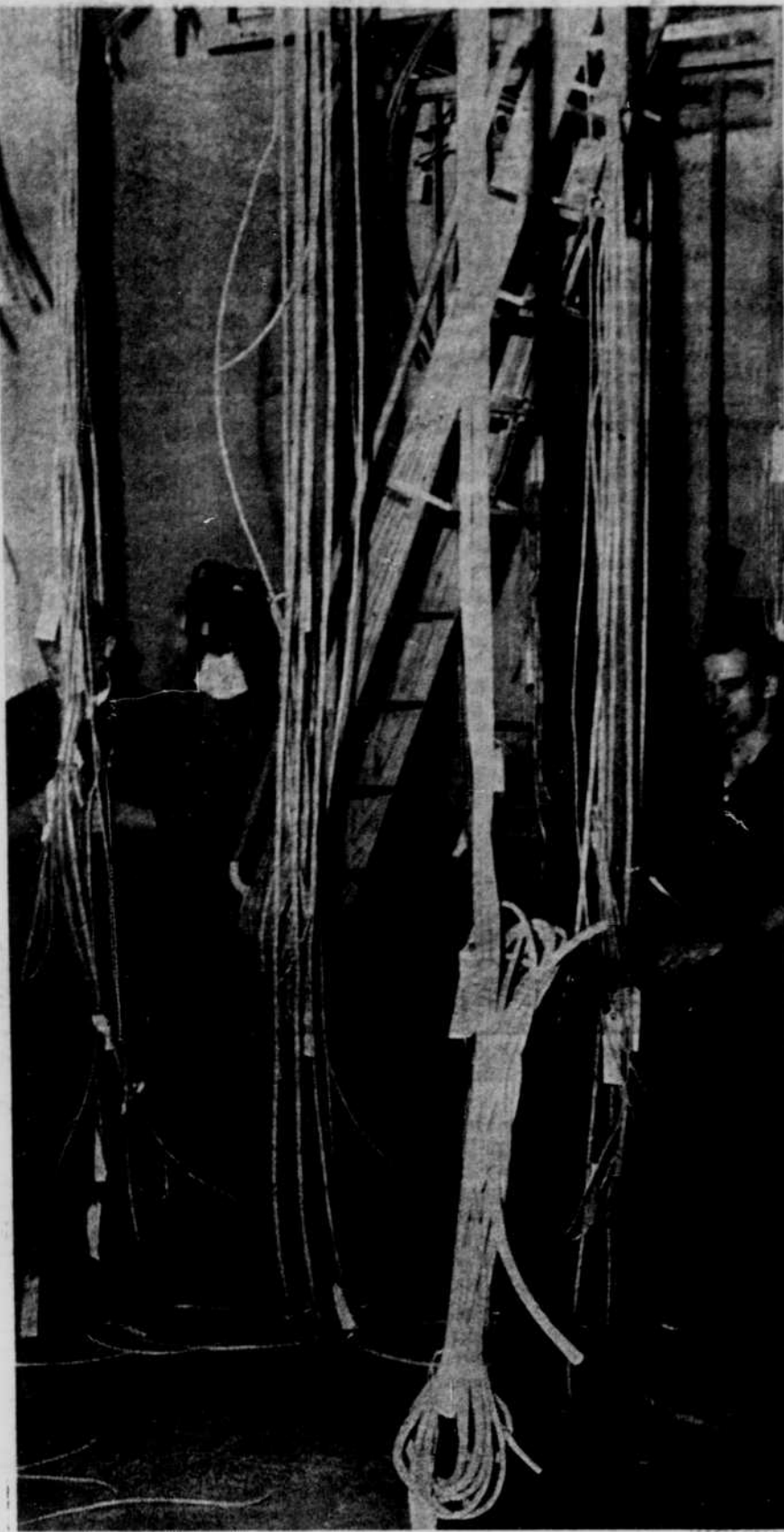
A MAZE OF WIRES confront workmen as they begin installing dial equipment in the new Northwestern Bell telephone office in O'Neill. Several months of work remains before the change to dial system is complete.