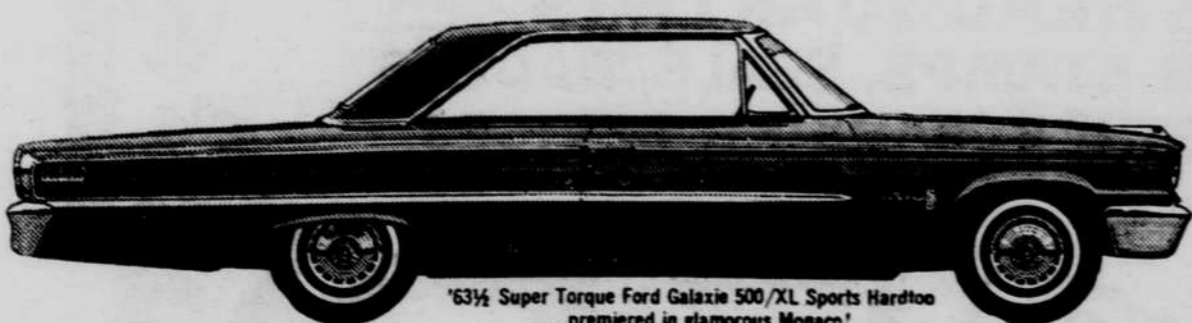
'63 1/2 Super Torque Ford Galaxie 500/XL Sports Hardtop... premiered in glamorous Monaco!