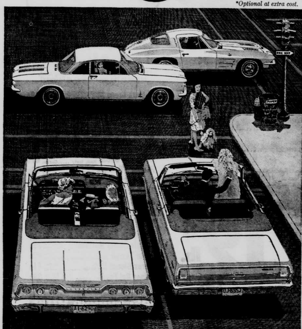
Top-Corrette Sting Ray Sport Coupe and Corvair Monza Spyder Club Coupe. Belowleft, Chevrolet Impala SS Convertible; right, Chevy II Nova 400 SS Convertible. (All four available in both convertible and coupe models. Super Sport and Spyder equipment optional at extra cost.)

over-and a whole lot more fun out of driving one! *Optional at extra cost.