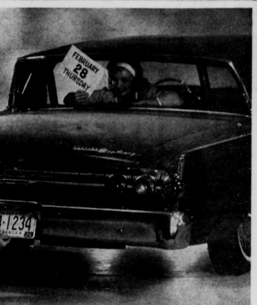
THE DEADLINE for obtaining 1963 auto license plates is near. Residents of Nebraska have until Thursday, Feb. 28, to obtain the new plates for their cars, and they are urged to get them soon so that they will avoid the last-minute rush and waiting in line.