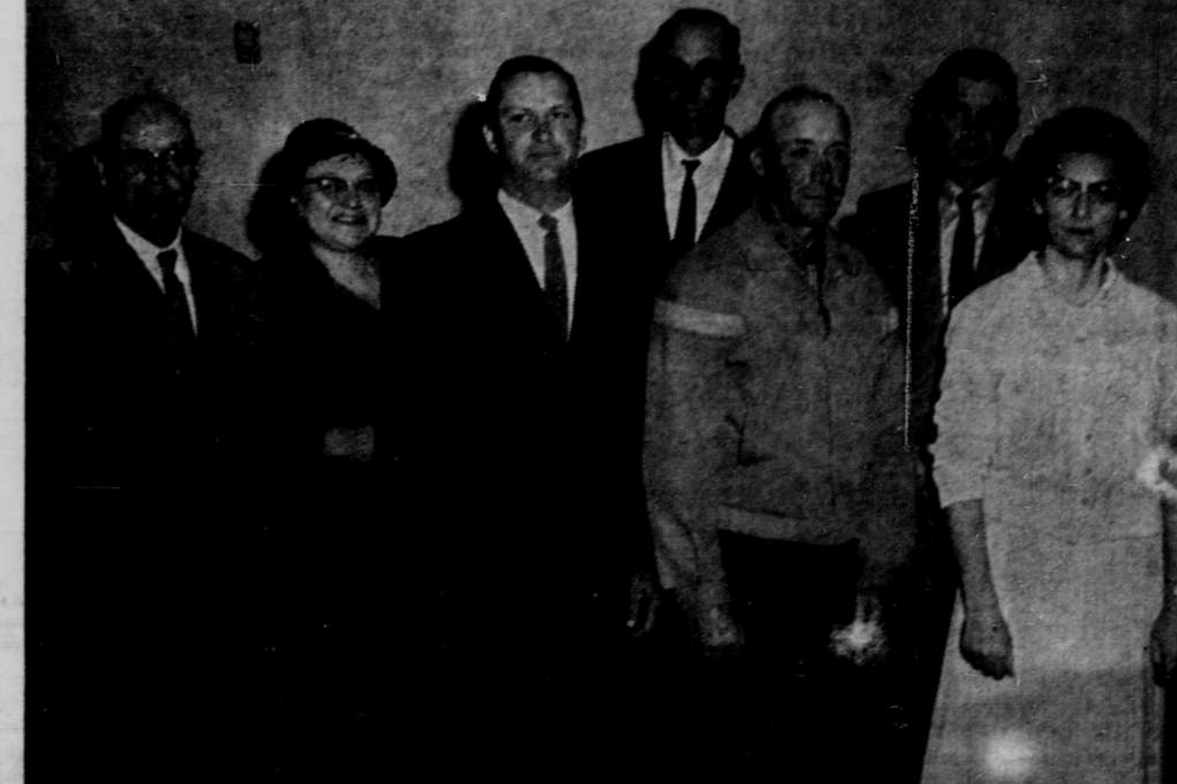
County Extension Service Officers Named Thursday

If future expansion of this proposed building ever proves necessary, this building is designed for possible addition at any of the four corners or classroom areas. Pre-requisites of good educational opportunities are adequate school facilities, qualified teachers and a balanced curricu-