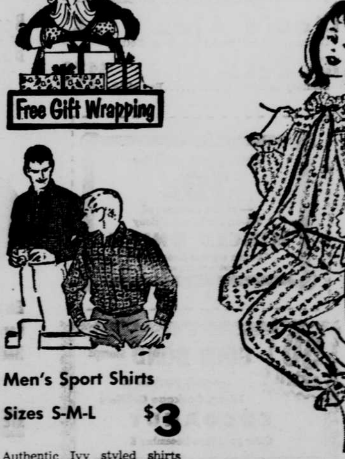
Authentic Ivy styled shirts in assorted patterns and collar styles.