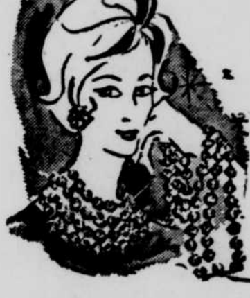
New Costume Jewelry Ideal Extra Gift!

Smart floral prints and white Necklaces, bracelets, pins and Leatherette covered box has with either lace or Schiffli earrings in silver, gold and 4 section lift-up tray, rayon fashion shades.