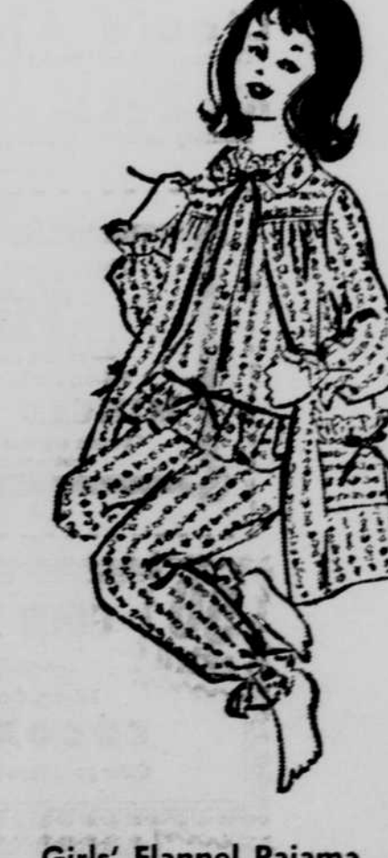
Girls' Flannel Pajama and Duster Set