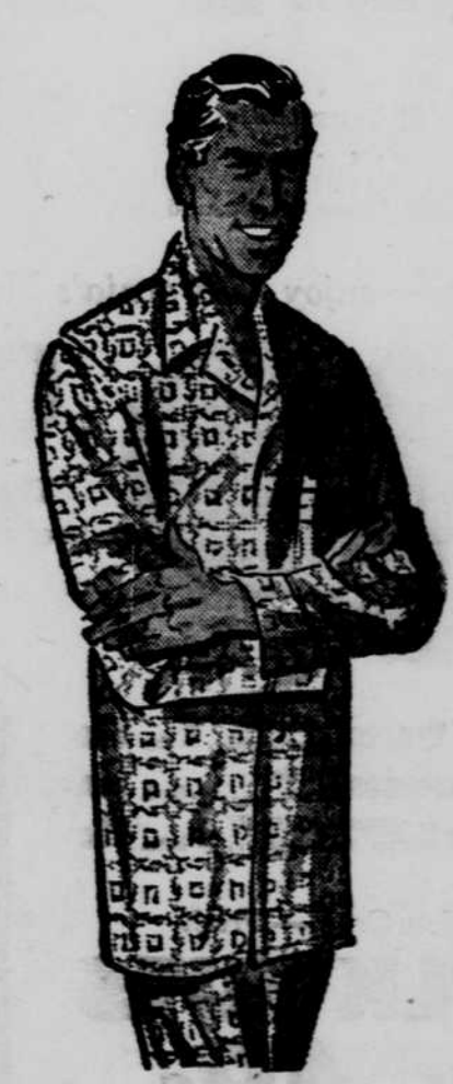
MEN'S PAJAMAS Regular 2.98 value

Tailored cotton pajamas in middy or coat style. Assorted printed patterns and stripes on light backgrounds. Fully cut.