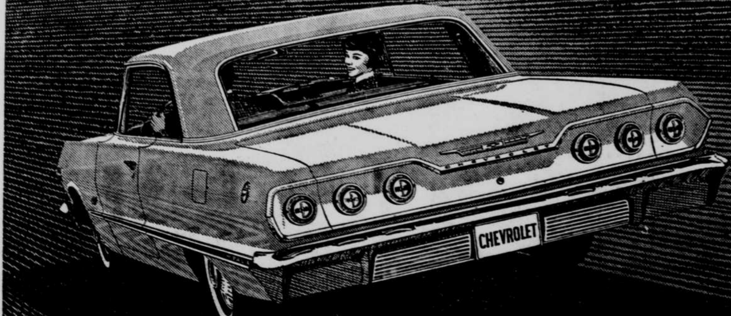
'63 Chevrolet Impala Sport Coupe

GO JET-SMOOTH '63 CHEVROLET-IT'S EXCITING!