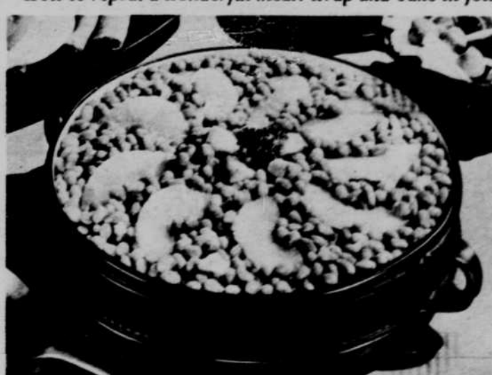
Pork and beans add pineapple to complement the turkey.