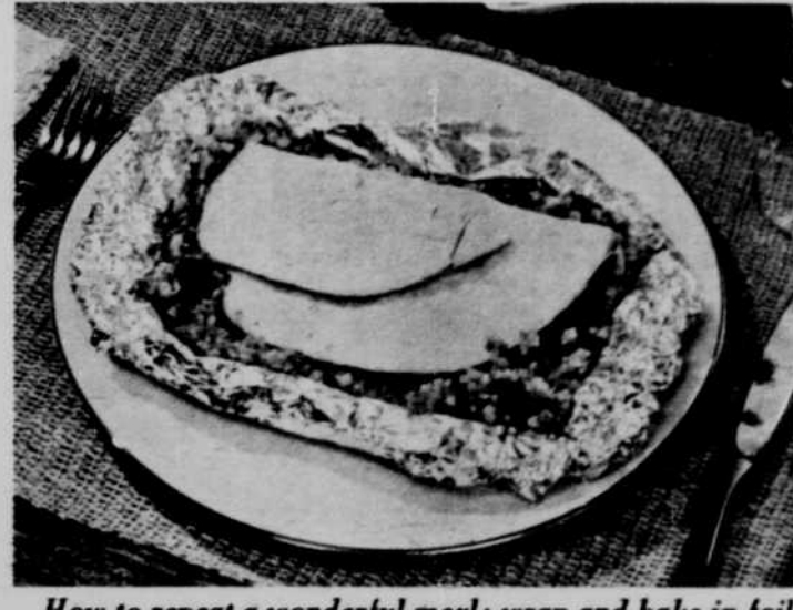
How to repeat a wonderful meal: wrap and bake in foil.