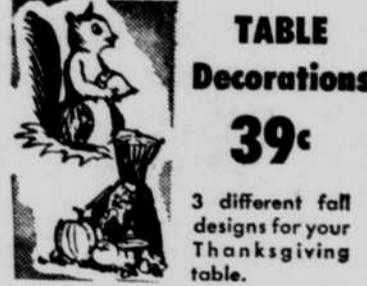
TABLE Decorations 39c

Cooking musts at Thanksgiving. Baster, fowl lacer, meat thermometer.