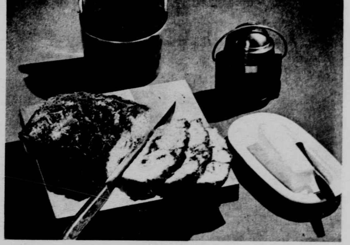
Cinnamon-y Butter Swirl Loaf is delicious fresh - but try it in toasted slices, too!

Crunchy Almond Topping bakes with the bread, filling goes in later!