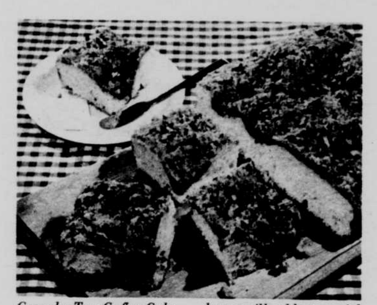
Crunchy Top Coffee Cake . . . buttermilk adds a special flavor under old-fashioned streusel topping and it almost melts in your mouth.

Serve the charms of a loaf swirled with cinnamon and butter, or filled with creamy custard. Share a rich quickbread made dark with molasses, raisins and nuts, or sunny with orange. Save all four of these recipes - for "best of all" coffee party plans!