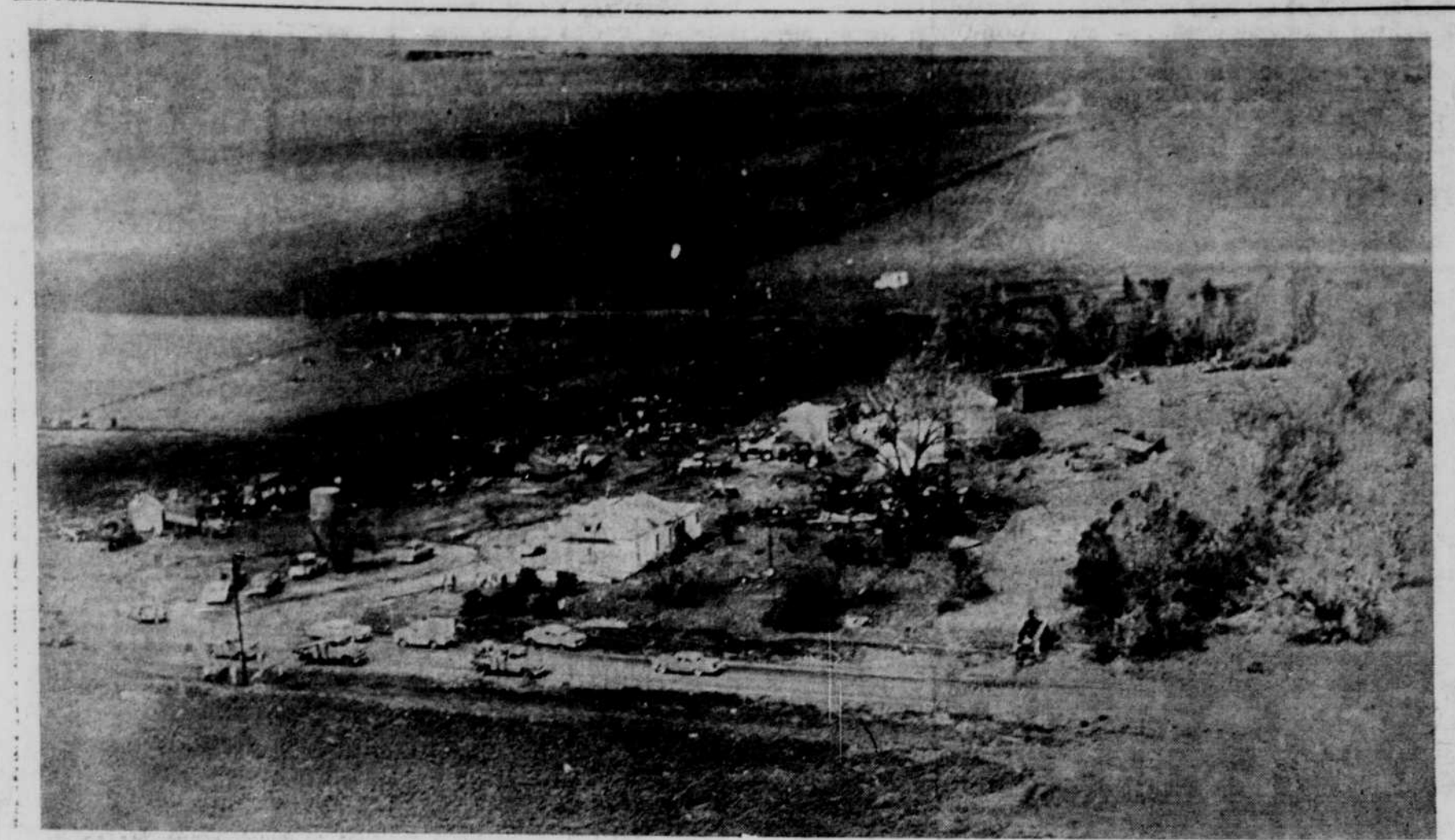
severely by a tornado which swept through the area. The Paul Honke farm, shown above, suffered damage to nearly all the buildings. The