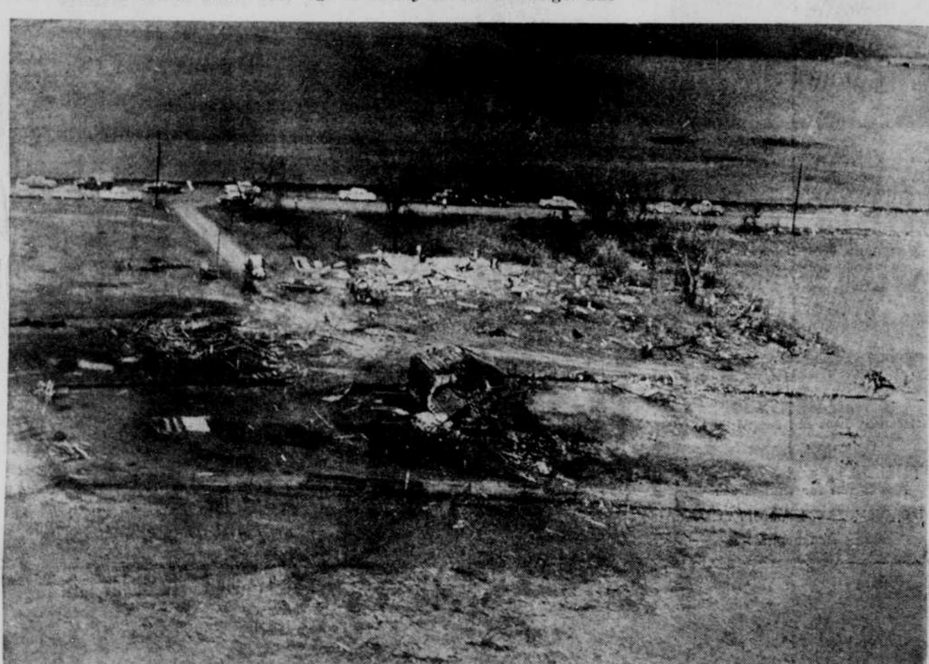
THE JOHN PETERSON FAMILY was injured when their farmhouse was demolished by the twist-.er. The Petersons, their daughter and her two child en were caught in the house when the storm struck. A storm cellar is located a short distance from the house but the Petersons were unable to reach it before the tornado struck.