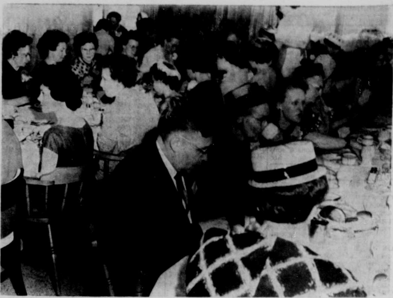
A Leadership recognition program for rural homemakers was held Thursday at the Town House in O'Neill. Sponsors were the O'Neill Chamber of Commerce, the Omaha Chamber of Commerce and the Nebraska Agricultural Extension Service.