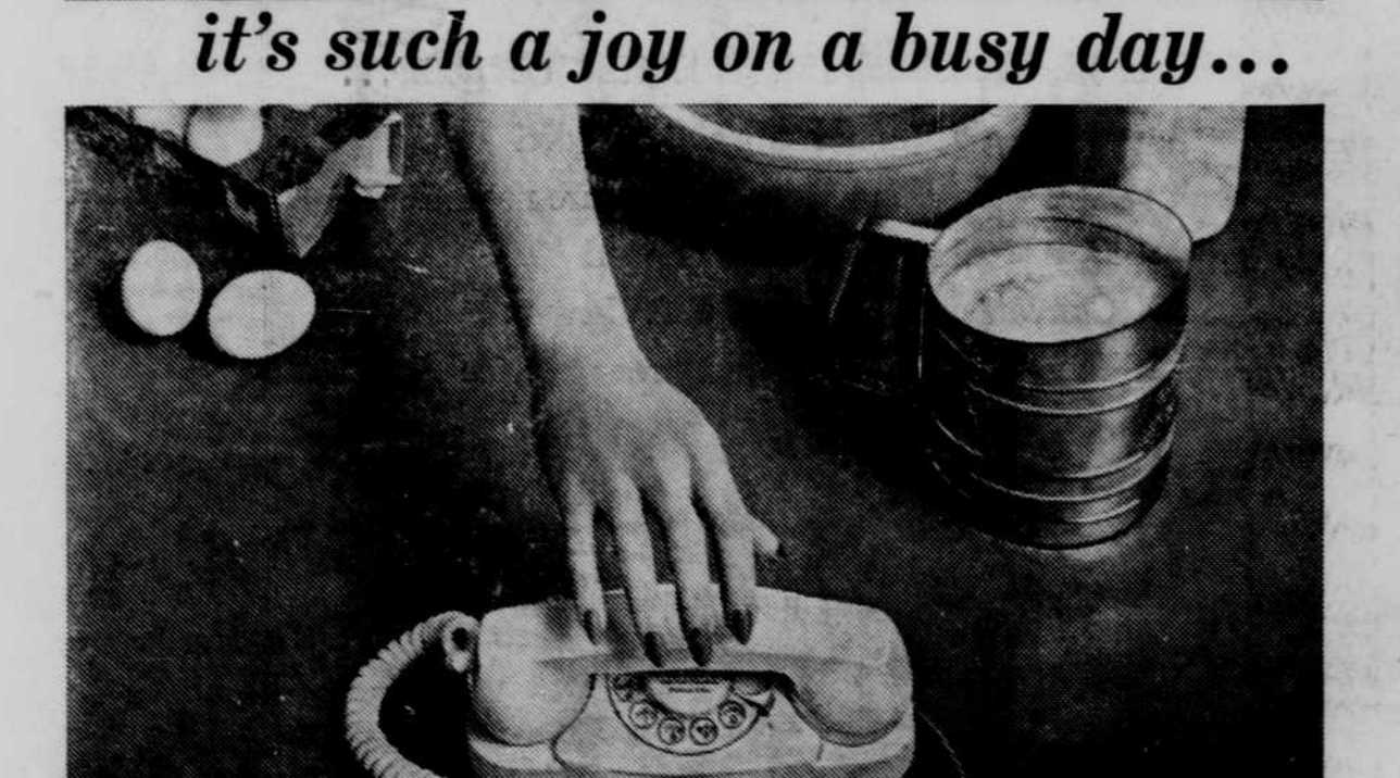
to have a phone a reach away!

Handy phones in kitchen, basement, bedroom save you countless steps and precious minutes throughout the day. And you can choose from many different models in a range of pleasing colors-space-saving wall phones; regular table models; or the compact new Princess phone with built-in night light.