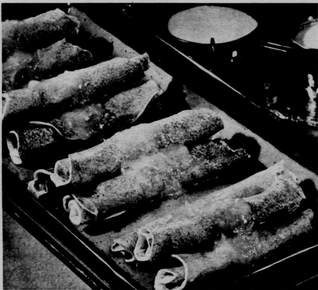
Ruth Andre chose Crepes for their breakfast — or main dish — or dessert versatility. Rolled up and served with orange sauce, they're a conversation-piece.