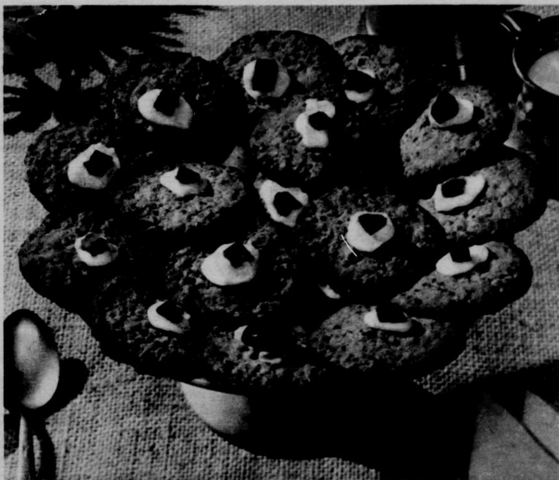
Grace Manney's cookie jar features Down East Fruit Cookies, a favorite with children. Molasses, cinnamon, nuts, raisins and glace fruit make them rich.