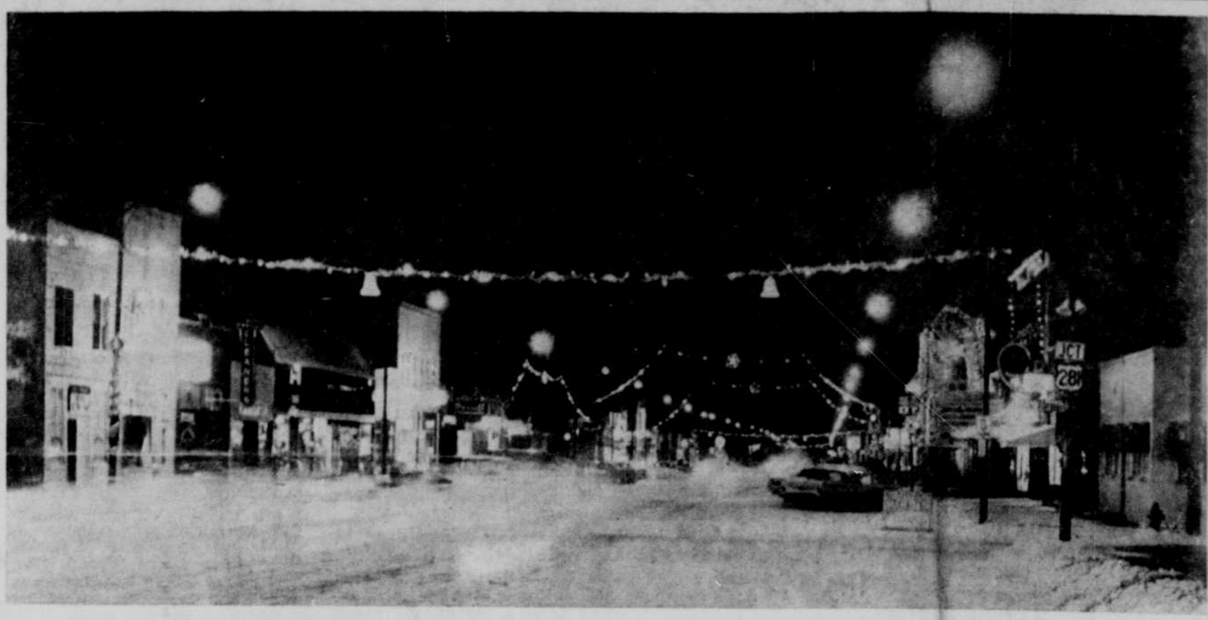
WINTER WONDERLAND. This picture was taken late at night of the main street through O'Neill. It shows the effectiveness of Christmas lights over the wide streets, combined with the sparkle of car lights and snow. The city decorations received favorable comment from one traveller. His impressions are printed in a "letter to the editor" on another page.