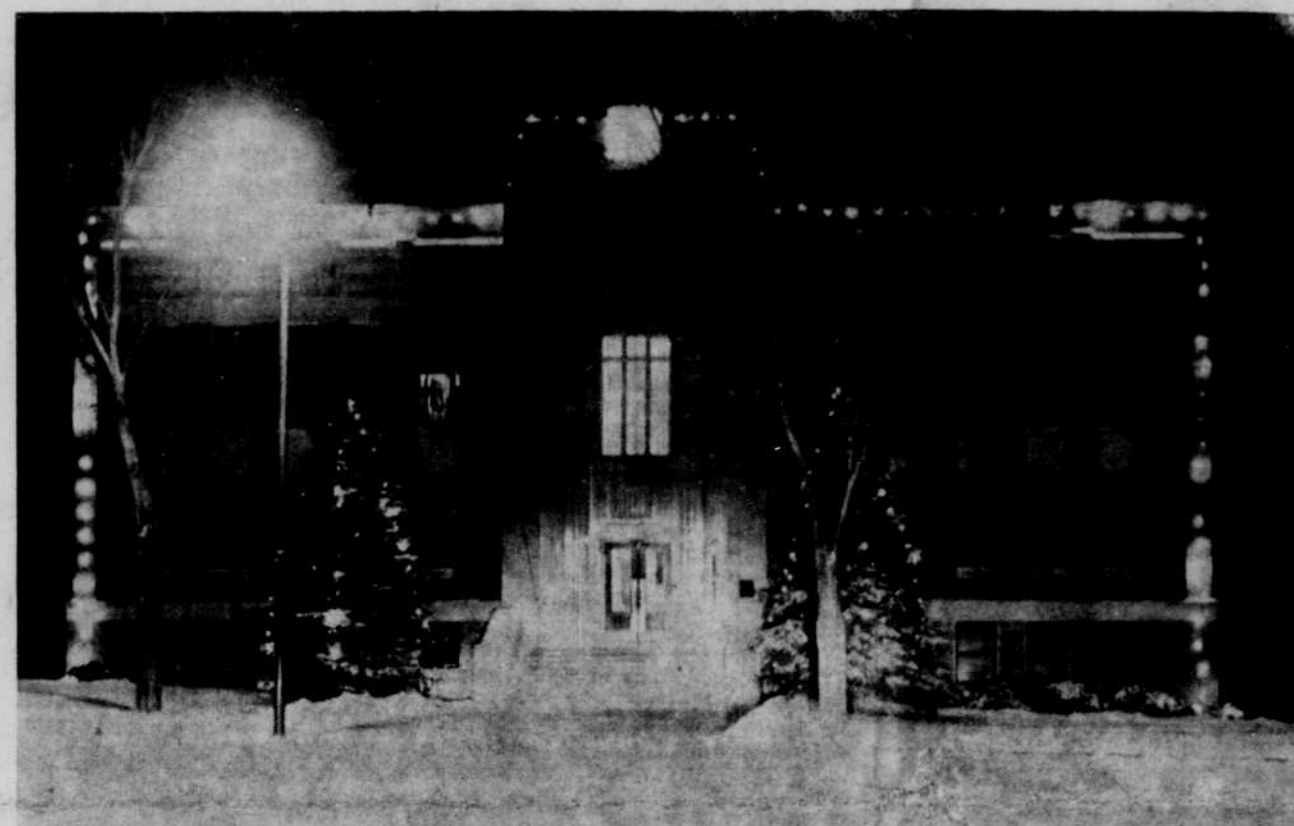
MERRY CHRISTMAS from the courthouse gang. (see story below)

They will be guests of the Lettermen club at a steak dinner in the home economic room at school. The party is being given in recognition of their fine football season. Other school personnel will also be guests at the dinner.