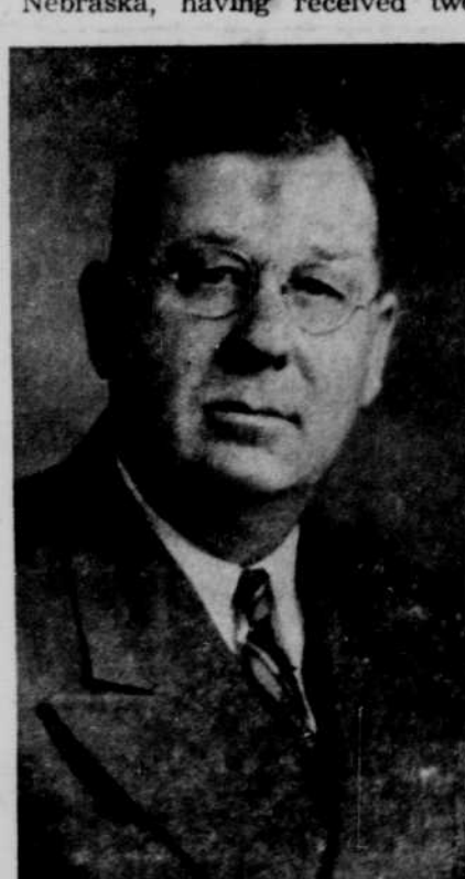
of the most coveted decorations of the French Government, the Croix de Guerre and the Medaille Militaire, and also the distinguished service cross from General Pershing for conspicuous bravery.