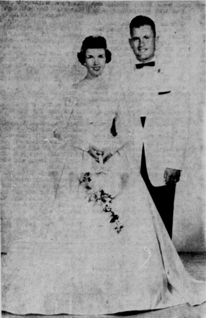
O'NEILL PHOTO CO.