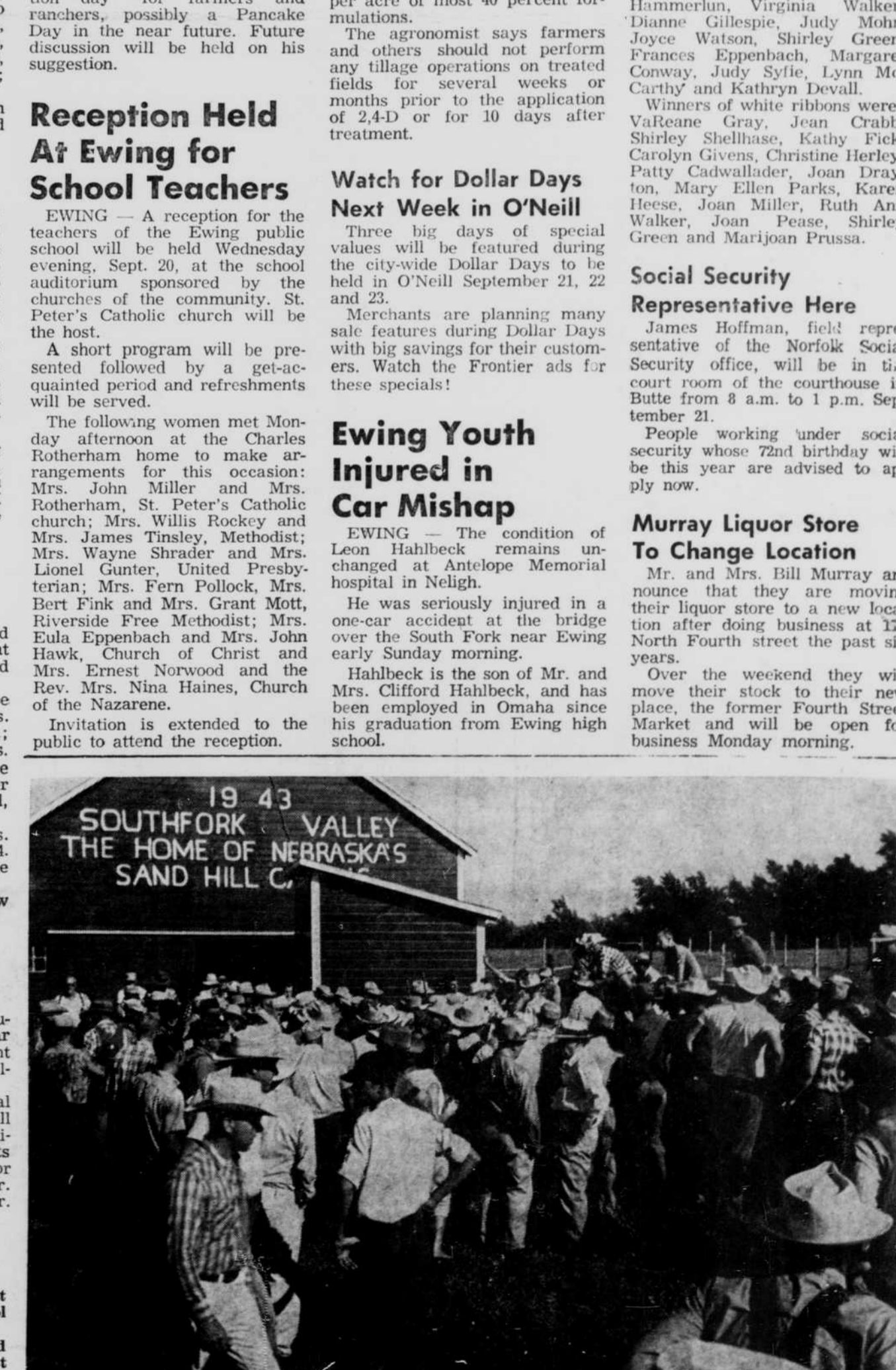
THE CLIFF FLEMING FARM SALE kicked off the fall farm sales with what may be one of the largest crowds of the season. Shown above is a small portion of the crowd as Auctioneers Ed Thorin, Roy Kirwan and Chuck Mahony seek bids on a piece of farm machinery. More than 220 cars, trucks and pickups were counted parked in and around the farmstead at one time, while hundreds of men and women bid on the farm machinery, household goods and livestock. Top price on Holstein milk cows on the sale was $330 while the 24 cows averaged nearly $260. Prices on other items on the sale ran high, too. This was another successful farm sale advertised through the Frontier's one-stop farm sale service.