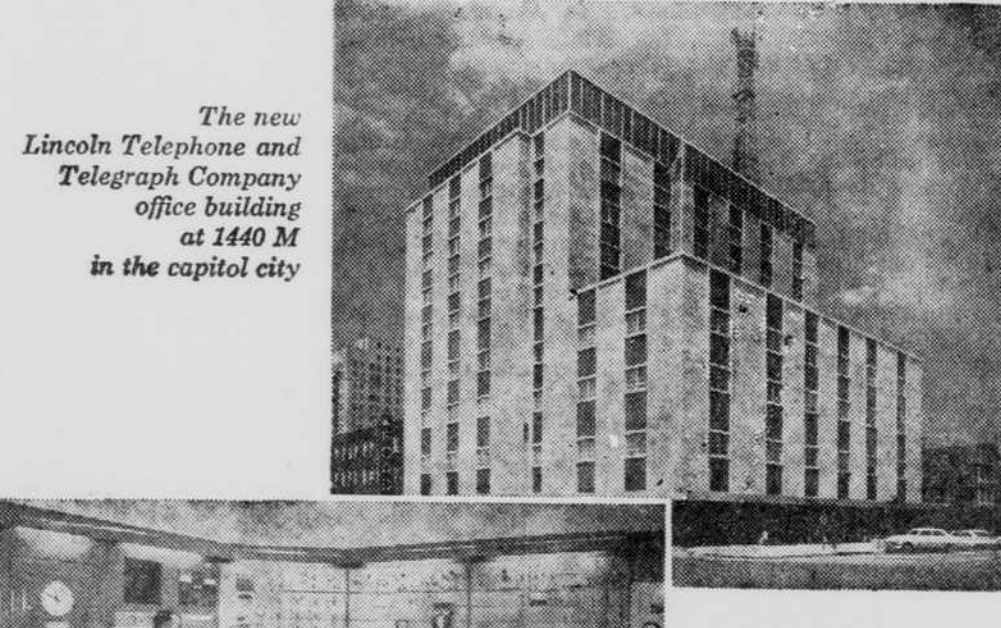
The new Lincoln Telephone and Telegraph Company office building at 1440 M in the capitol city