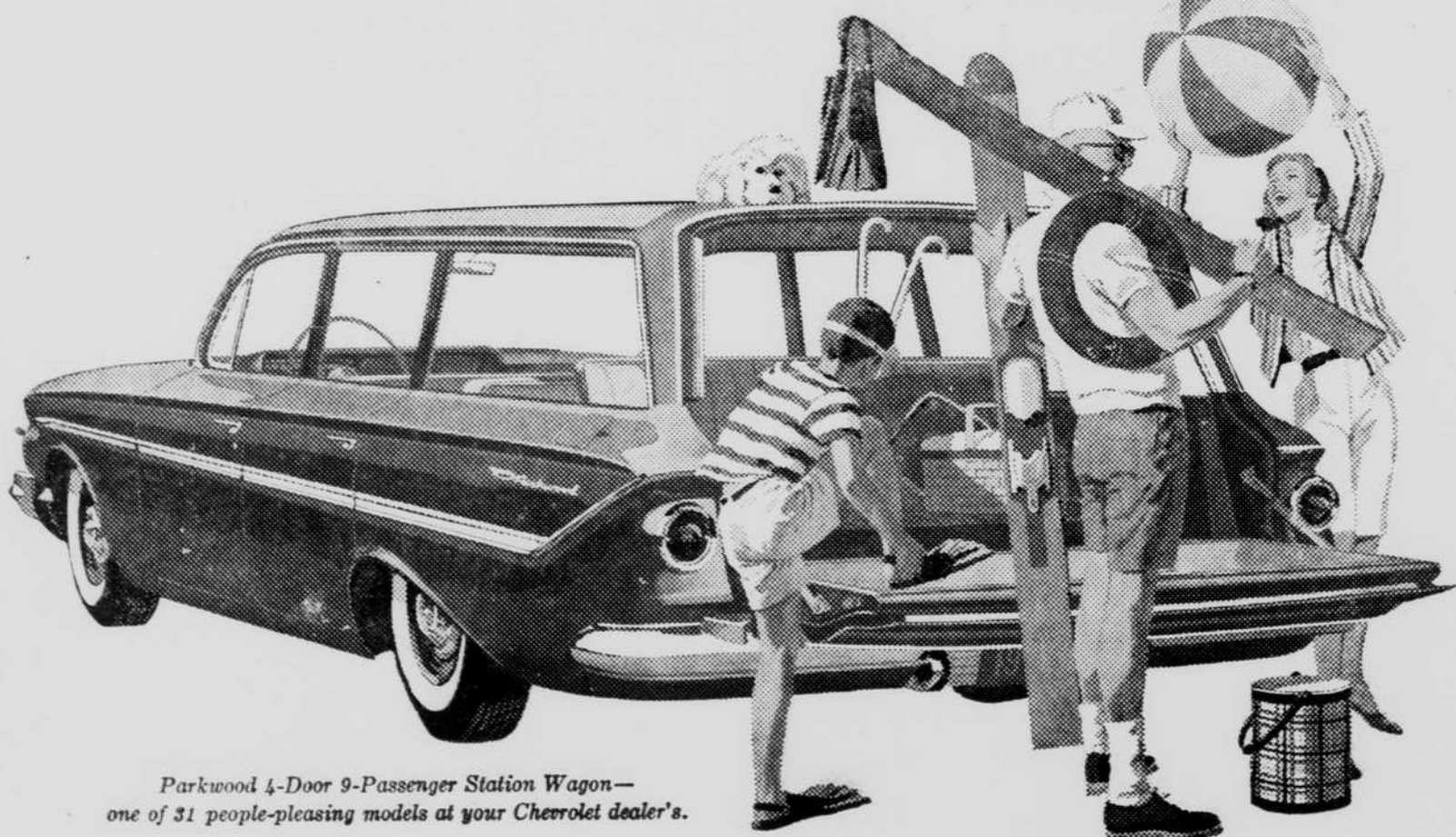
Parkwood 4-Door 9-Passenger Station Wagon— one of 31 people-pleasing models at your Chevrolet dealer's.

Bright woven plaid in famous Dan River cotton at a low price! Sizes 10-20. Capris or pedal pusher! Lilac, mint green, black random cotton cord. 10-18. 100% cotton in new brilliant spring colored shorts and pedal pushers! 3-6. Favorite funtimes! Random cotton cord in gay spring-looking colors. 7-14. White or bright Sanforized cotton broadcloth! Roll-up or sleeveless. 7-14. Terrific variety in fabric and color choice, plain or patterned! 7-14.