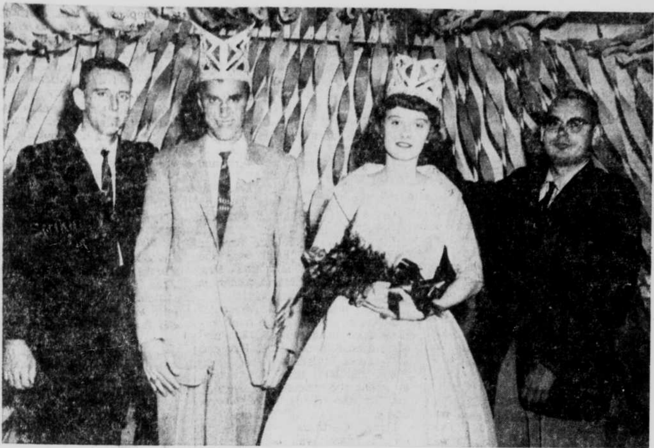
A BRIGHTLY DECORATED gym added color to the enjoyment of the O'Neill high school students at their Basketball Frolics Tuesday evening.